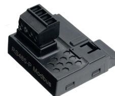
Modbus RS485 P